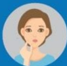
Avoiding touching the face